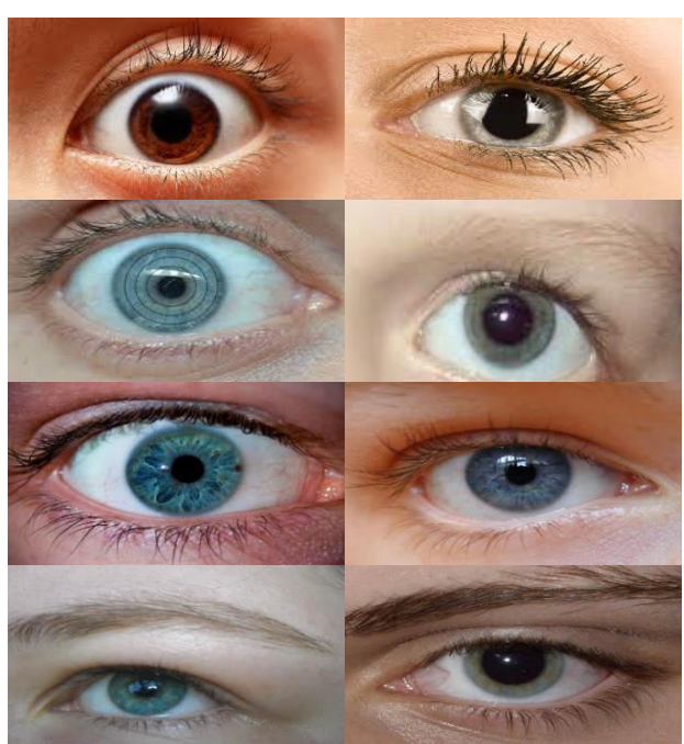
Figure 2: Normal Eye Images